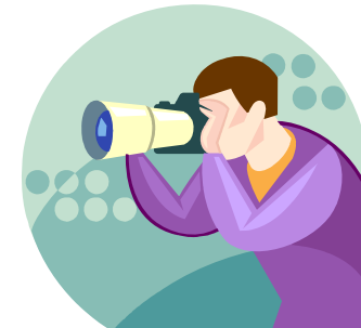
SHOW PHOTOGRAPHER Michael Loftis Photography